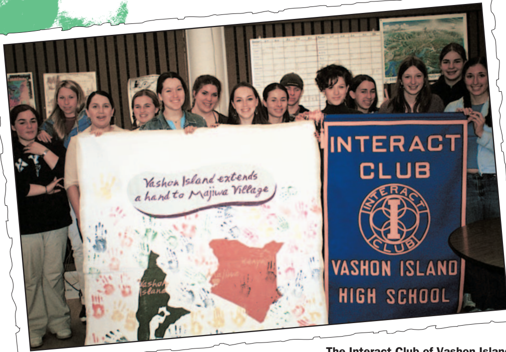
The Interact Club of Vashon Island High School has made it possible for some Kenyan orphans to continue their schooling.

E ver since you were five or six years old, the classroom has been an almost daily part of life. There have always been teachers to teach you how to make sense of words on a page, to add and subtract numbers, and to learn the many other skills you will need as an adult.